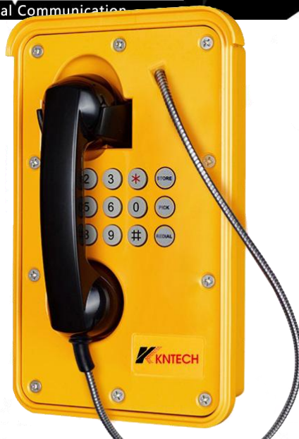
VOIP KNSP-09T2S wall mounted