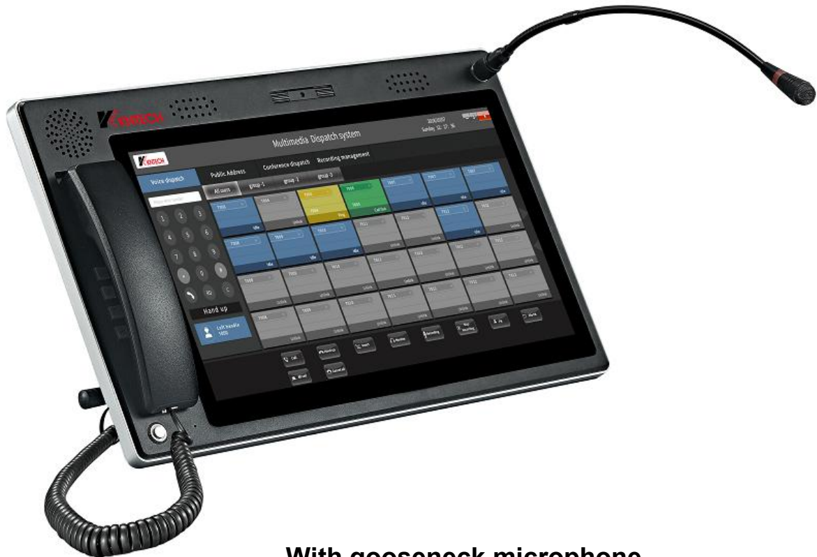
With gooseneck microphone