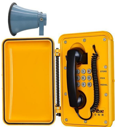
VOIP KNSP-08-IP-Y Loudspeaker Telephone