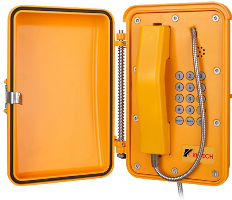
VOIP KN-SP-19-IP-Y Water roof Phone