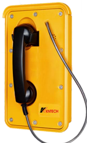
VOIP KNSP-10T2S-IP-Y Auto Dial